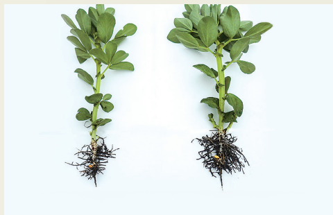
Single-action TagTeam faba bean

The synergy of the rhizobia bacteria and the soil fungus working together creates more fixed nitrogen and better access to soil and fertilizer phosphate, providing the balanced nutrition necessary to maximize your crop's yield potential.